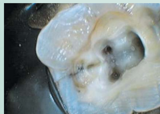
Figure 2. Prominent isthmus between mesiobuccal and mesiolingual canal orifices.