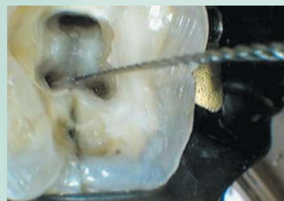
Figure 3. Initial exploration for the middle mesial canal with small-sized hand files.