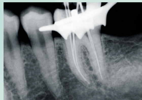
Figure 4. Radiograph with instruments placed at working lengths determined by an apex locator.