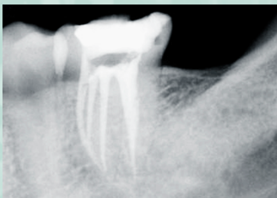
Figure 8. Postoperative radiograph with exaggerated distal angulation demonstrating a confluent mesiobuccal and middle mesial canal and a separate mesiolingual canal.

sealer, Ultradent Products, South Jordan, UT). The orifices were sealed with a light-cured flowable composite (ie, GC UniFil Flow, GC America, IL) and the access was closed with a cotton pellet and an interim restorative material (Figures 7 and 8).