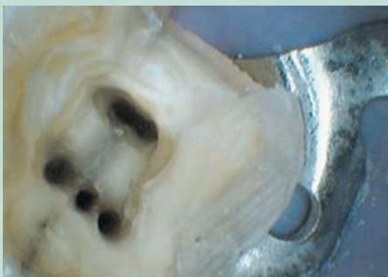
Figure 6. Clinical photograph demonstrating distinctive presence of a separate orifice for the middle mesial canal.