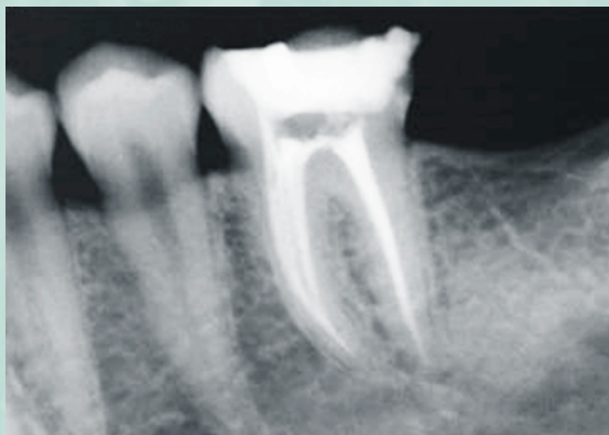
Figure 7. Immediate postoperative radiograph.