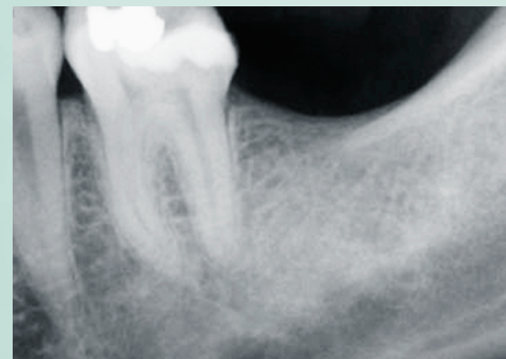
Figure 1. Preoperative radiograph of tooth #19(36) is indicative of a fractured distal marginal ridge with recurrent caries.

In this case, the confluent middle mesial canal joined the mesiobuccal canal at the apical third; the mesiolingual canal remained separate (Figures 5 and 6). The two distal canals joined to exit in a single foramen. The canals were instrumented with hand and nickel-titanium rotary endodontic instruments (eg, ProTaper, Dentsply Tulsa Dental, Tulsa, OK; K3, Sybron Endo, Orange, CA). Alternating irrigations of 5.25% sodium hypochlorite and 17% ethylenediamine tetraacetic acid (EDTA) were used, and final irrigation was performed with 0.12% chlorhexidine followed by a local anesthetic solution. The canals were obturated with laterally condensed resin-coated gutta-percha (ie, EndoREZ points and EndoREZ